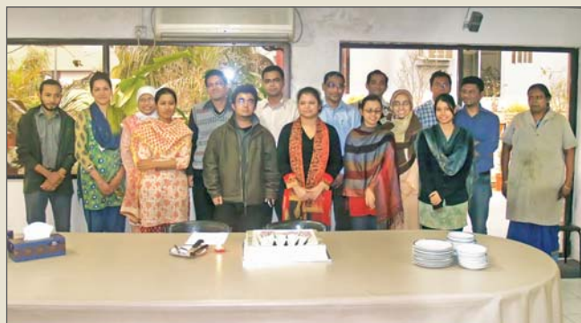
Joint Birthday Celebration (October to December 2010) of CPD family on 27 January 2011