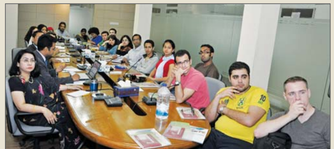
Students of Georgetown University, Qatar visited CPD on 3 March 2011; CPD senior researchers briefed them on CPD's dialogue and research activities and the state of the Bangladesh economy