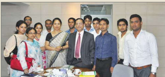
Students of Economics Department of Jagannath University, Dhaka visited CPD on 14 March 2011